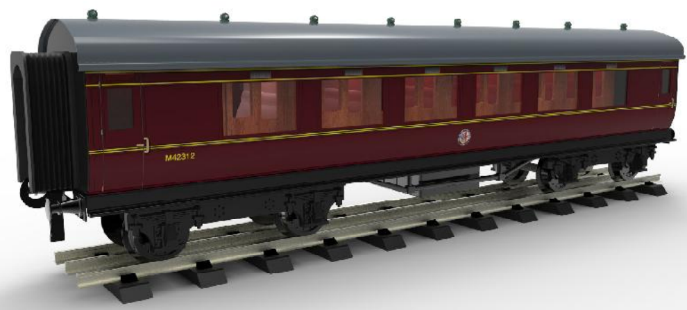
BR Maroon (Ex LMS Period II)