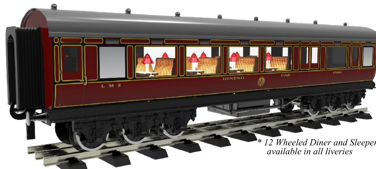
* 12 Wheeled Diner and Sleeper available in all liveries