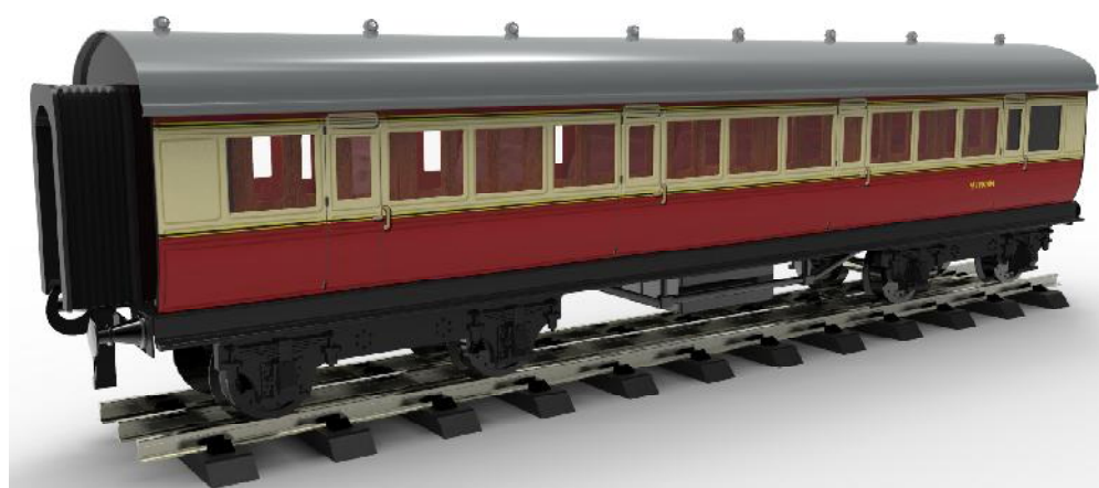
BR Carmine & Cream (Ex LMS Period I)

Others : The Night Ferry Pullmans and Brighton Belle in BR Grey/Blue MET Pullmans Galatea and Mayflower Maroon Pullmans LMS The 40 cm Marklin replicas EMUs